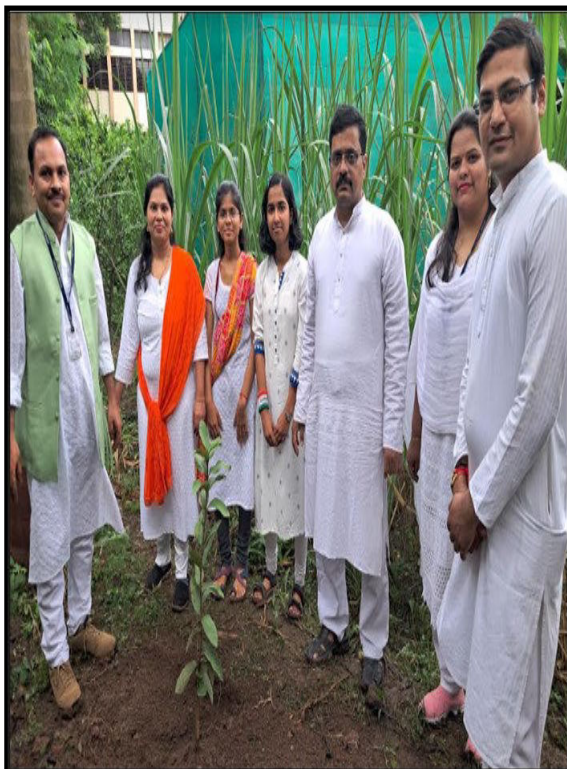
Tree plantation drive for celebrating the 75th Years of Independence as "Azadika Amrit Mahotsav" as initiative by IETE Pune Local Center