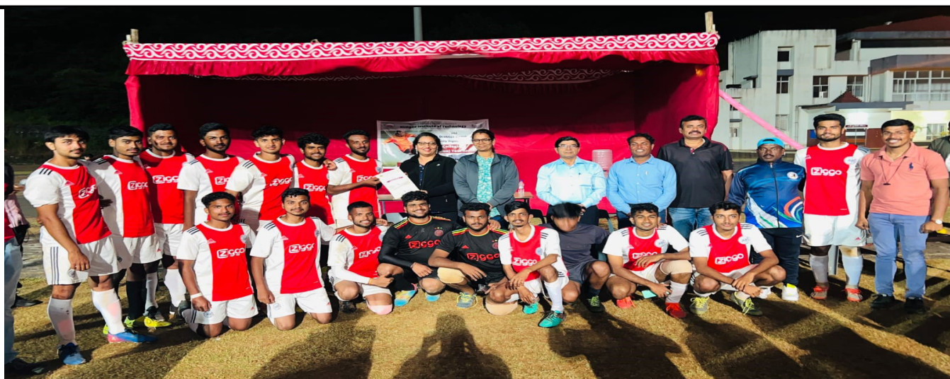
DYPCOE Akurdi team

5.The TE students of the department participated in SPPU sports competition and stood second runner up (DYPCOE Akurdi team) in Football tournament.