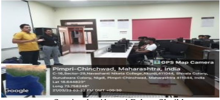
Session by Alumni Rehan Shaikh