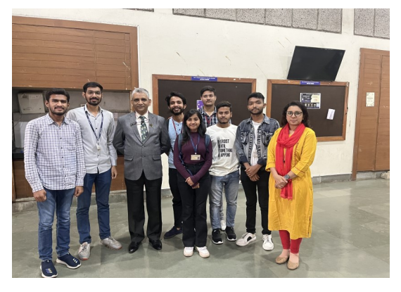
One day Workshop on MRC at COEP