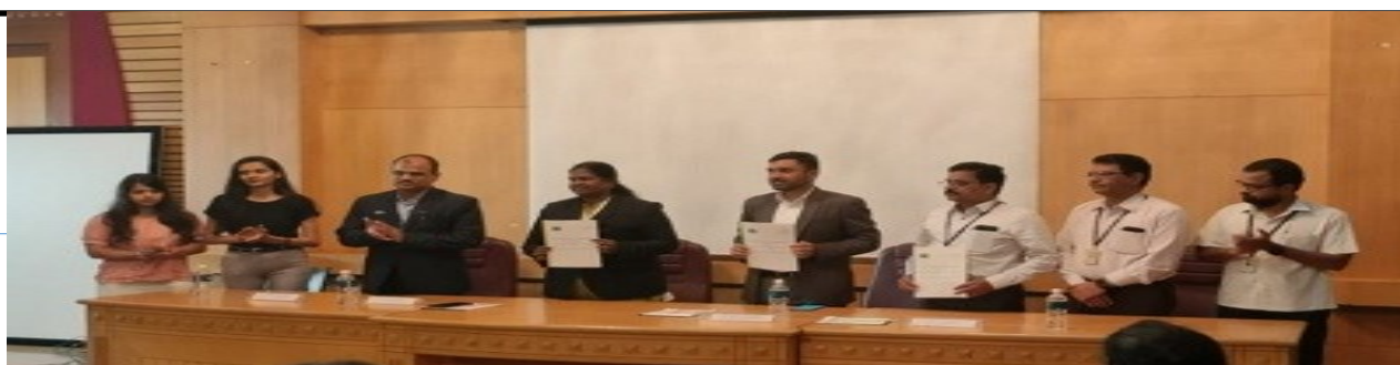
MOU Signing Ceremony