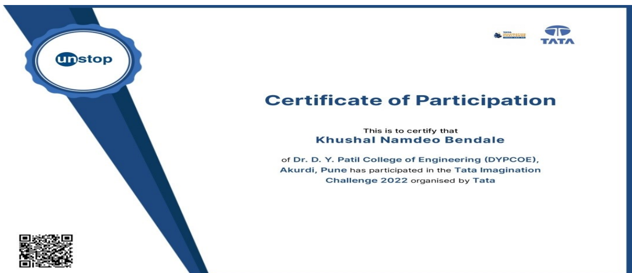
Certificate by Tata