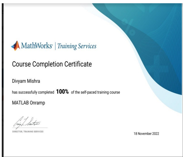
Certificate by Mathworks