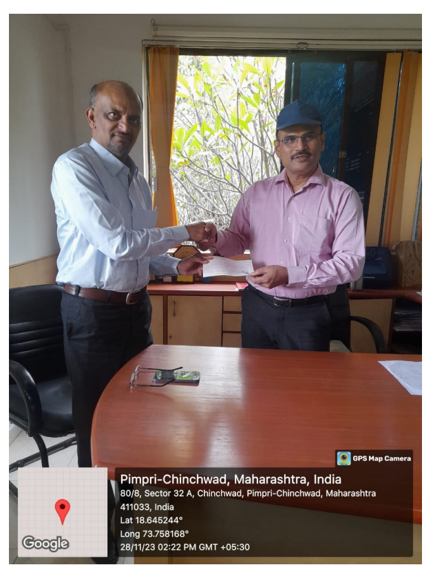
External Academic Audit