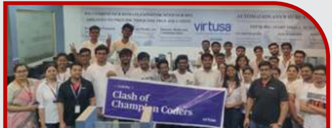
Third Year Engineering students in Codelite. 20 hrs. Coding Challenge organized by Virtusa