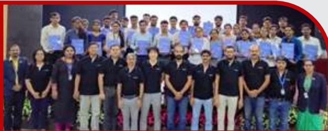
Students placed in NTT Data 2020 Graduating Batch