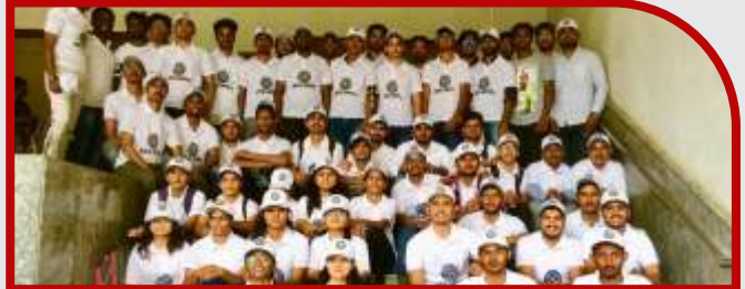
NSS team participated in tree plantation held by SPPU and contributed to Guinness World Record by planting 6000 trees