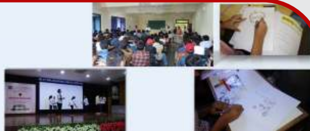
Glimpses of First year Induction program