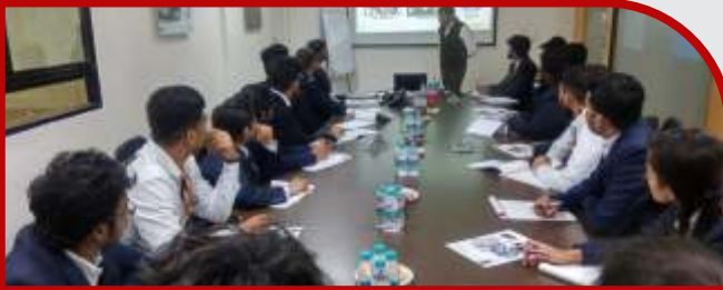
One Day Training for Students and Faculty Members on Industry 4.0 by Renishaw Metrology Systems Ltd