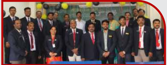
Technical Scavenger Hunt Event by PESA in Tantrotsav 2K20