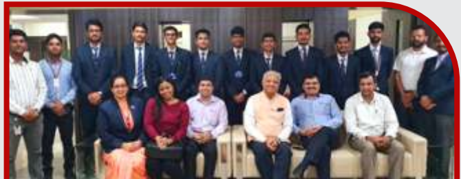
Students placed in Torrent Gas 2020 Graduating Batch