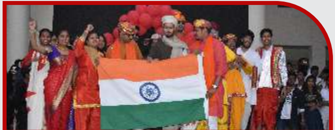
Celebration of Theme day @ DYPCOE, Akurdi