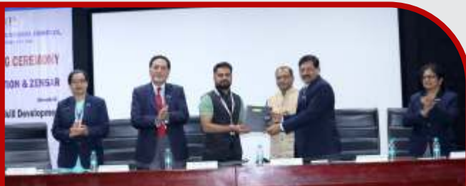
MoU signing Ceremony with RPG Foundation & Zensar