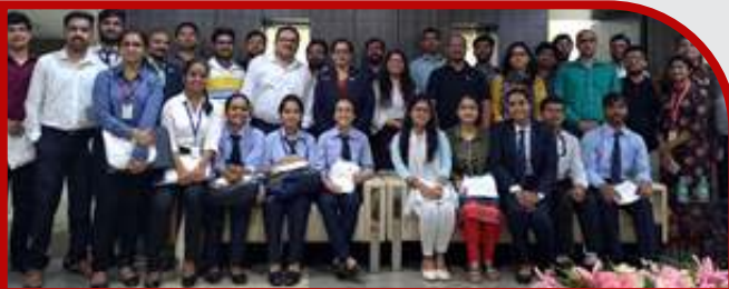
Students placed in Altimetrik India 2020 Graduating Batch