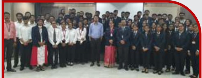
Students placed in Capgemini 2020 Graduating Batch