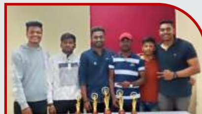
MORYA Festival-2020, 2nd Prize (Kabbadi)