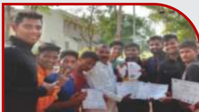
ZENITH-2020, 1st Prize (Kabbadi)