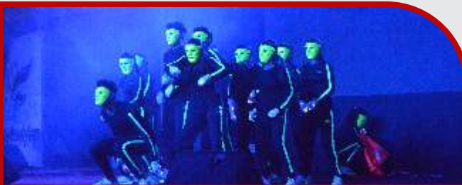
Dance Performance on Cultural Night