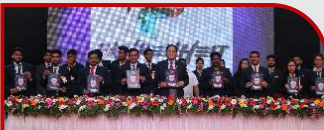
Unveiling of the magazine 2020