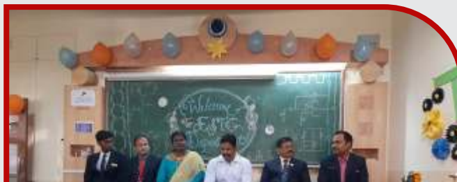
Celebration of Tantrotsav-2020 with the Tech-Tatva of E & TC