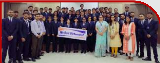
Students placed in NTT Data 2020 Graduating Batch