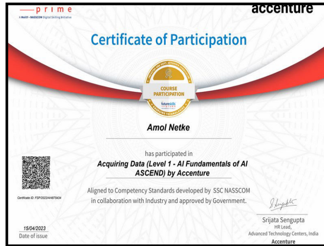
“Certificate of Participation”