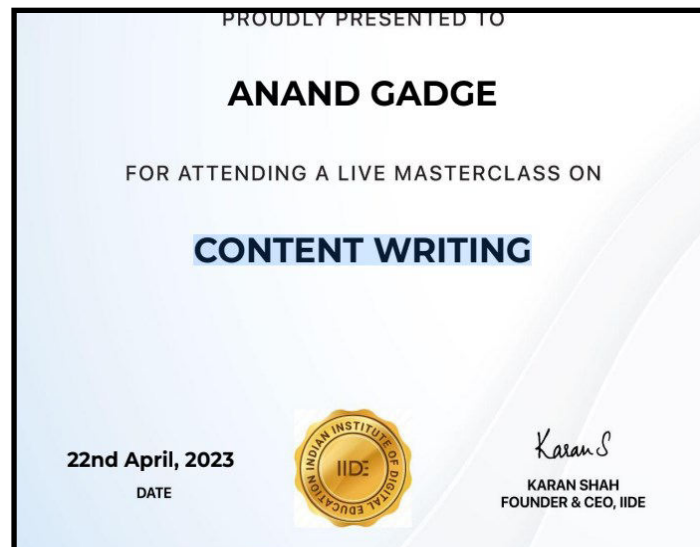
“Certificate of Participation”