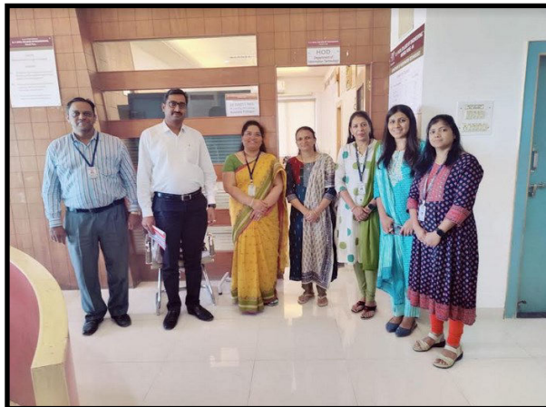
“Expert Session for NBA Guidance”