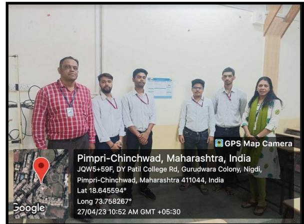
“Project Poster Presentations”