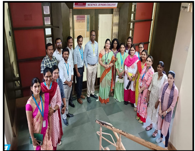
“Expert Session at DYP Junior College”