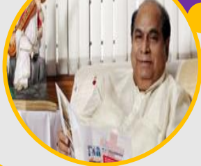
Hon. Pad Dr D Y Patil Founder President