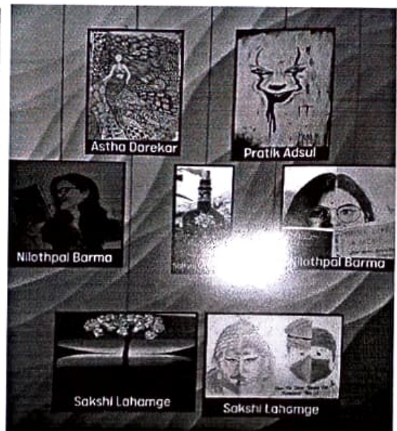
Front page Photograph of 'Bhavsparsha' Magazines' & Poster Presentation By Students