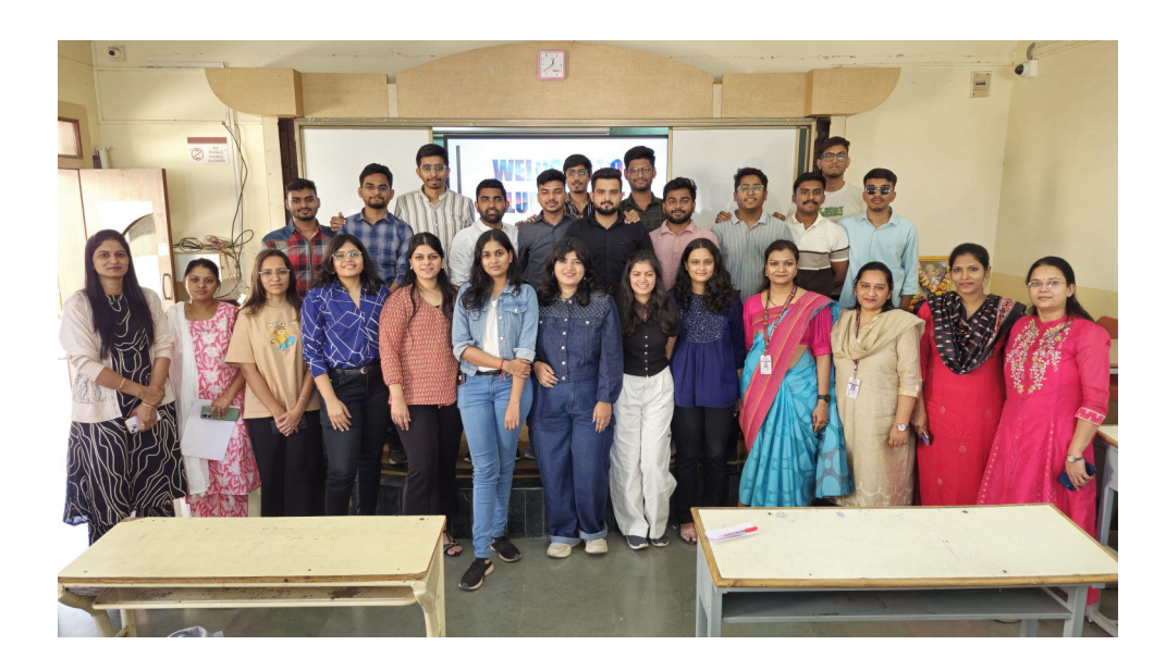
Some Glimpses of the Alumni Meet