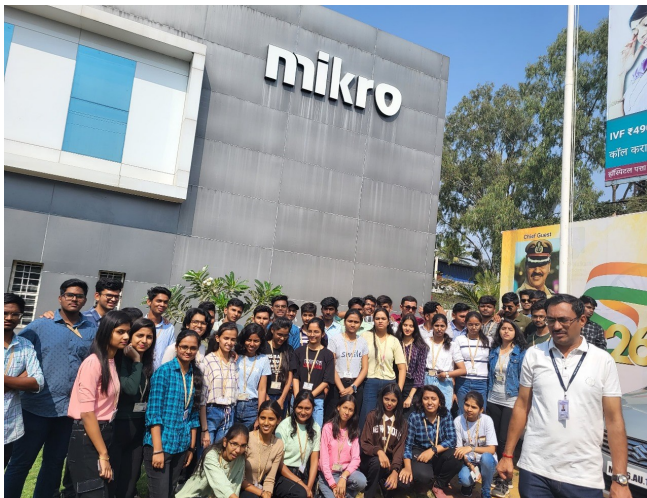
Industrial Visit to Mikro Innotech Pvt. Ltd.