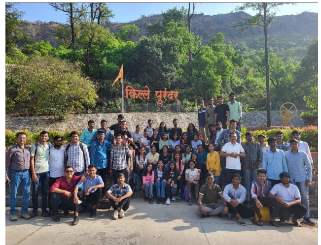
IKS Activity- Visit to Purandar Fort