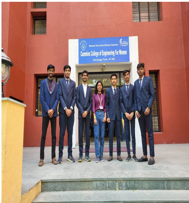
ISA Member Students @ Cummins