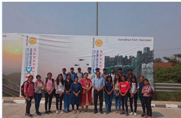
Visit to MSME Expo