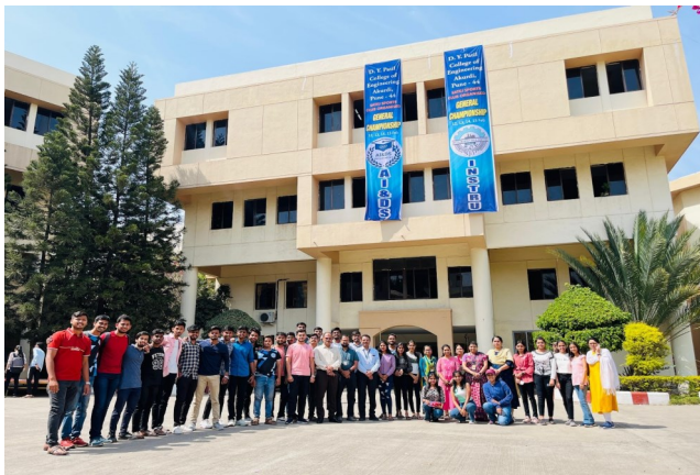
Participation in Tech Fest & Traditional Day