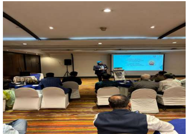
ISA Annual General Meeting