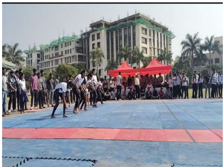
Students at Sports