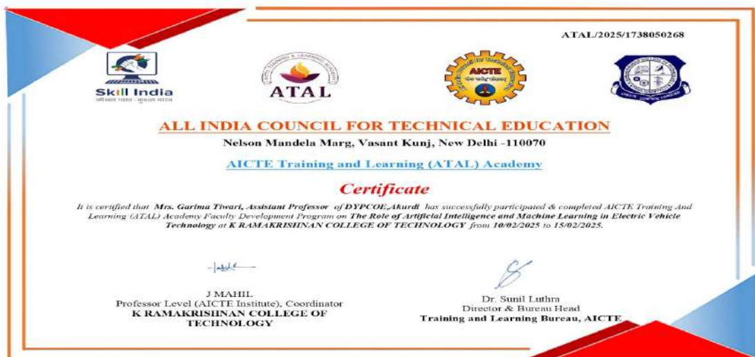
ATAL FDP Certificate