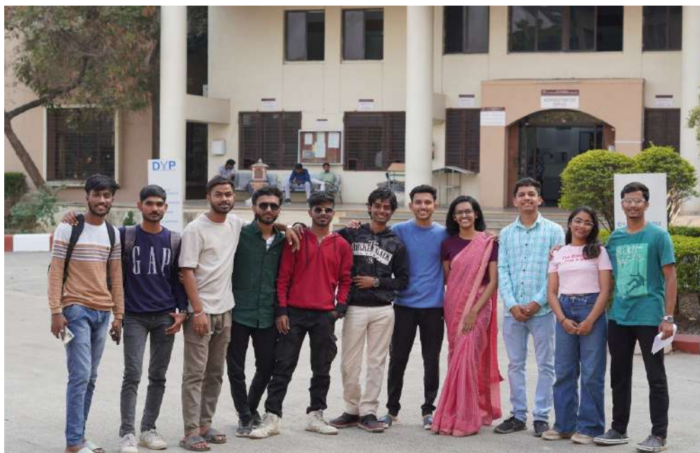
Students at Technical Events