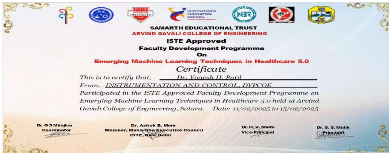
ISTE FDP Certificate