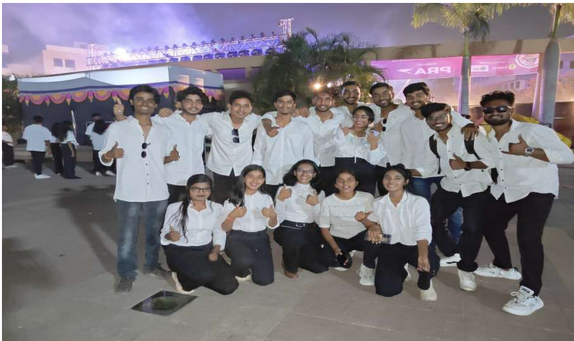
Dance Participation by Dept Students