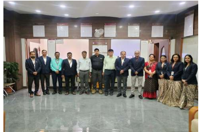
Board Of Studies Meeting