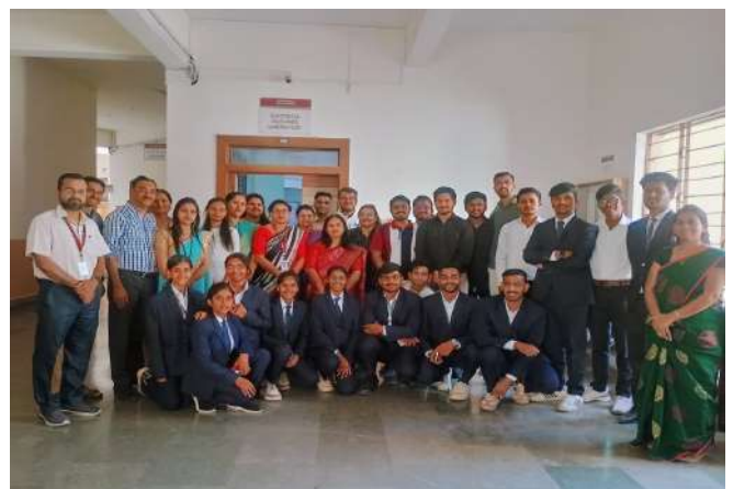
Alumni Meet 2025