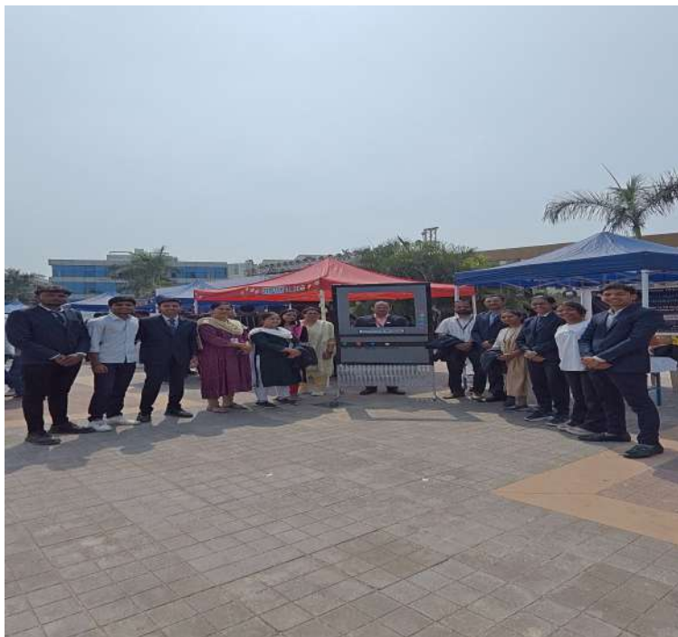
Students at Technical Events