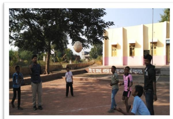
iv) Personality Development Games