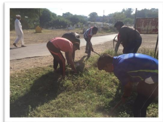
ii) Grabage Collection