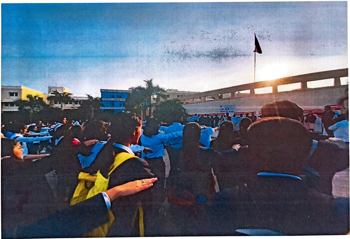
Photo 1&2- Preamble taken by everyone.